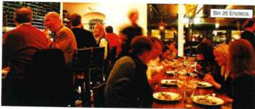
Bin 26 Enoteca.

Stop by the 21st Amendment (148 Bowdoin Street, 617-227-7100) for drinks after work and see the State House well represented—not to mention the many Massachusetts General Hospital docs and nurses who wander in for a nightcap. With more than 200 wines by the bottle, Bin 26 Enoteca (26 Charles Street, 617-723-5939) offers an intimate setting for both lunch and dinner. No. 9 Park (9 Park Street, 617-742-9991) is tucked away beside Boston Common, where executive chef Barbara Lynch's inspired take on French and Italian country cuisine makes it one of the nation's best places to dine. Recently opened by chef Ken Oringer at the Nine Zero Hotel, KO Prime (90 Tremont Street, 617-772-0202) offers a creative take on the traditional steakhouse. At the XV Beacon Hotel, Mooo (15 Beacon Street, 617-670-2515), formerly the Federalist, will feature inventive steakhouse cuisine expertly prepared by chef Jamie Mammano.